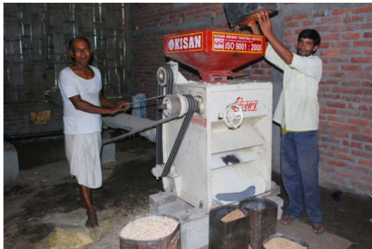
ANAMIKA JLSG RICE MILL SONALIBORI, KOLABARI, SONITPUR

The UCO bank Gohpur sanctioned an amount of Rs 4 lakhs to this four member group under CM'sJJSY. They started a rice mill and turmeric grinding machine with that money. At present they have been earning about Rs 10-15 thousand per month. The loan repayment process is going on.