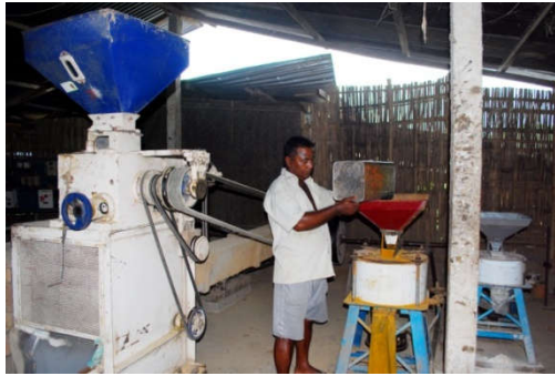
TRIDIP JLSG RICE MILL SONITPUR

The UCO bank Gohpur sanctioned an amount of Rs 4 lakhs to this four member group under CM'sJJSY. They started a rice mill and turmeric grinding machine with that money. At present they have been earning about Rs 10-15 thousand per month. The loan repayment process is going on.